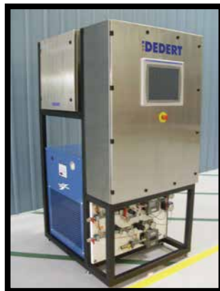
Control & utility panel