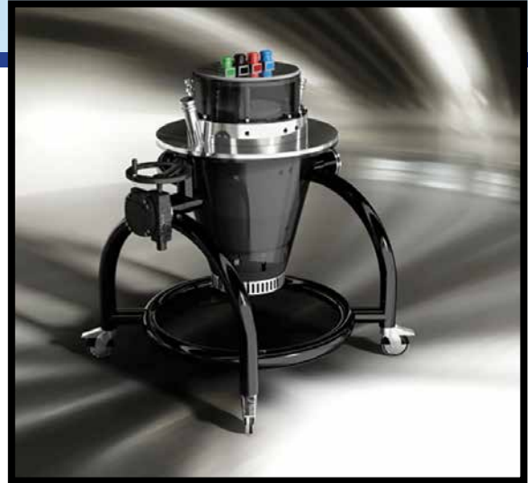
MSM-250 Magnetic Spray Machine

Dedert continues its long history of product innovation in industrial process equipment with the development of an advanced rotary atomizer for spray dryers, an adjustable air distributor, and a range of resealable flat and curved explosion venting doors. The design and operating features of these devices are outlined below.