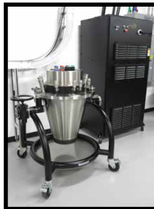
Variable speed drive