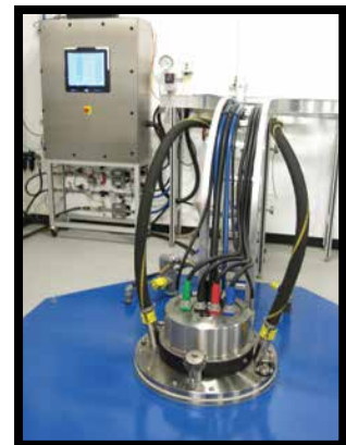
Atomizer test facility