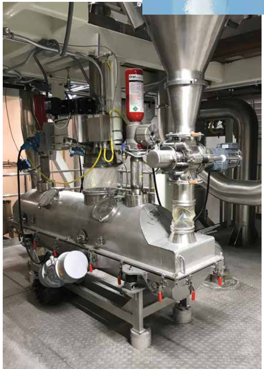
Multi-Stage Spray Dryer External Fluid Bed