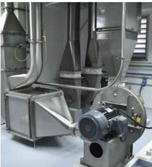
Air Handling Room