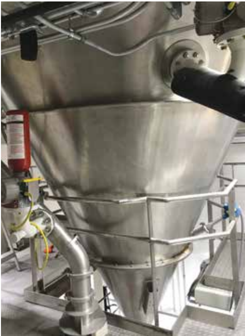
3 Meter Drying Chamber