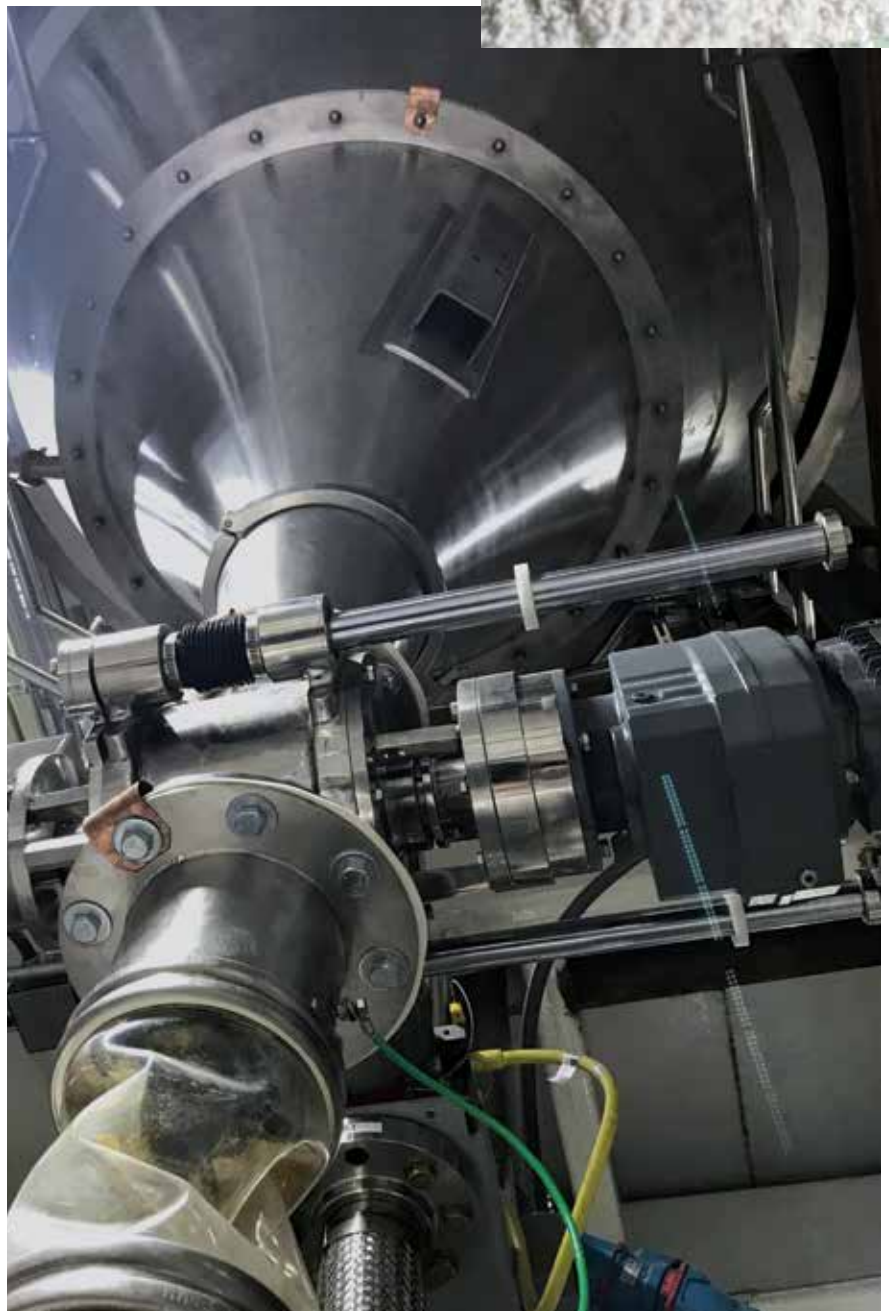
Drying Chamber Discharge