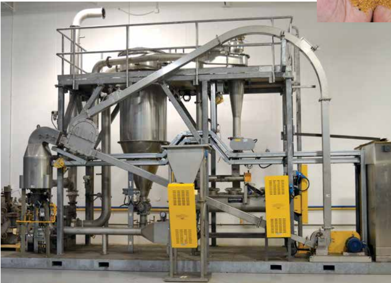
5 x 5 Ring Dryer