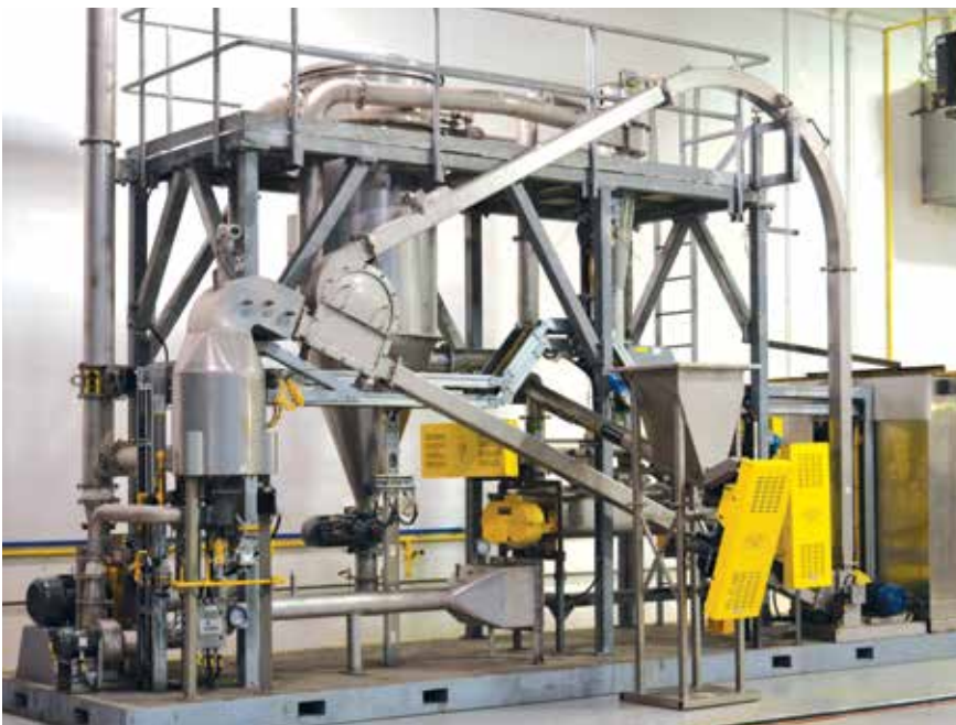
Pilot Ring Dryer