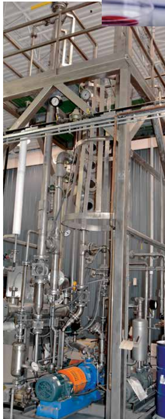
Falling Film Configuration