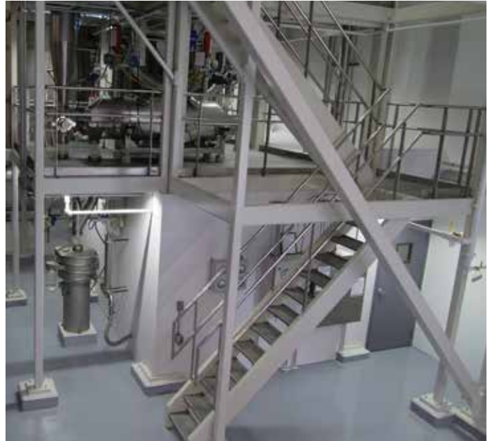
Pilot Spray Dryer

As well as testing, Dedert also offers modular pilot drying and evaporating systems for purchase to customers looking for a small scale production plant.