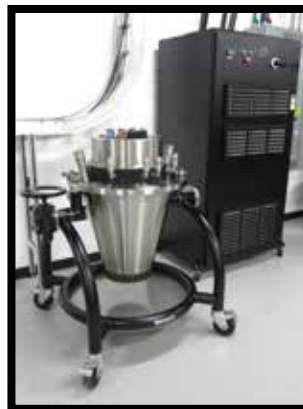
Variable speed drive