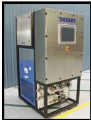
Control & utility panel