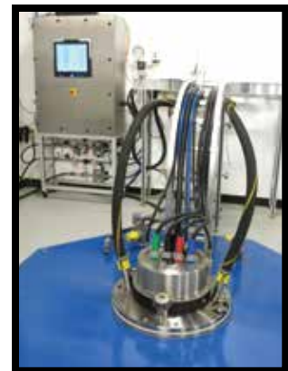
Atomizer test facility