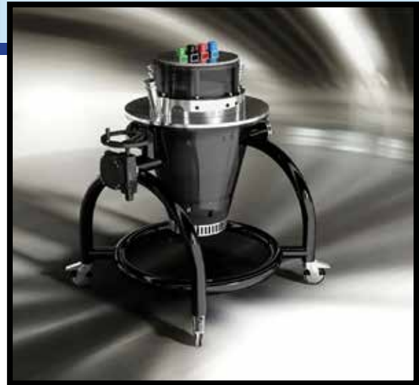
MSM-250 Magnetic Spray Machine

Dedert continues its long history of product innovation in industrial process equipment with the development of an advanced rotary atomizer for spray dryers, an adjustable air distributor, and a range of resealable flat and curved explosion venting doors. The design and operating features of these devices are outlined below.